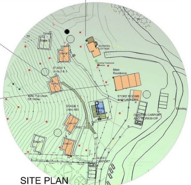
SITE PLAN RESIDENCES AND VILLAS