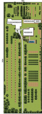
REARDONS ROAD SITE PLAN