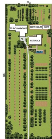
REARDONS ROAD SITE PLAN