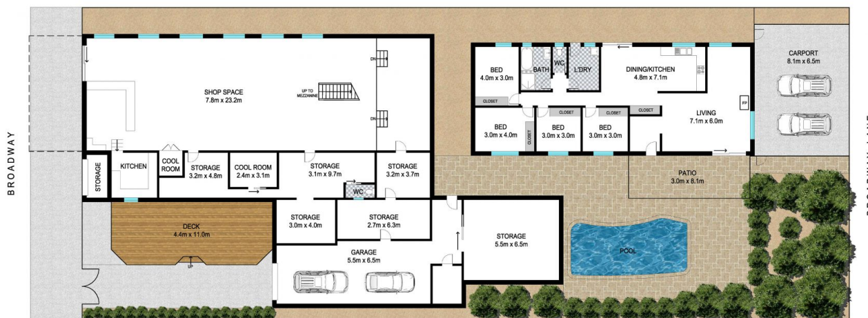
GROUND FLOOR AND SITE PLAN