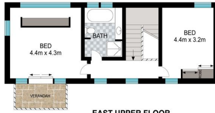
EAST UPPER FLOOR